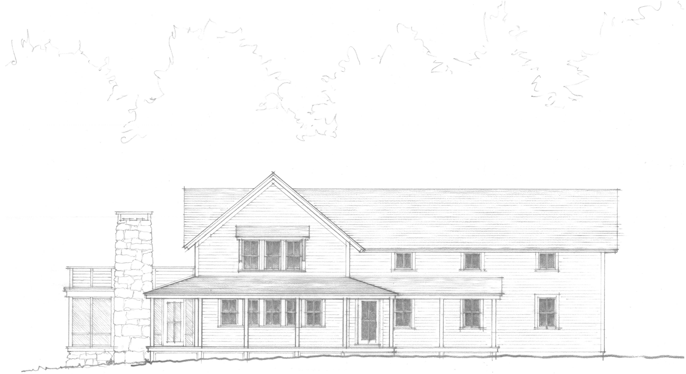
○ EAST ELEVATION SCALE: 1/8" = 1'-0"