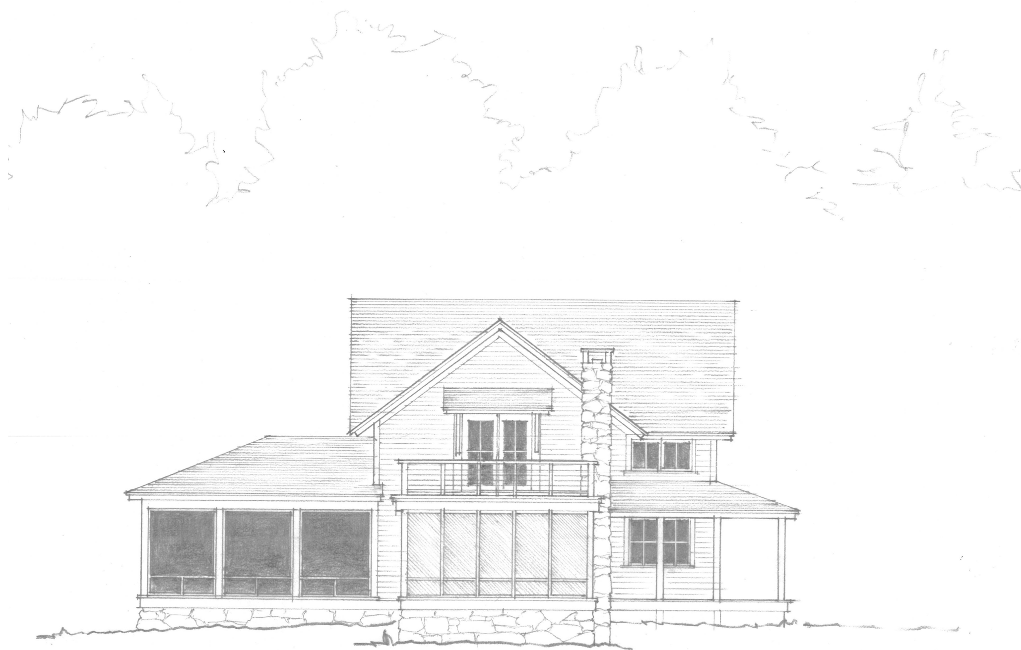
○ SOUTH ELEVATION SCALE: 1/8" = 1'-0"